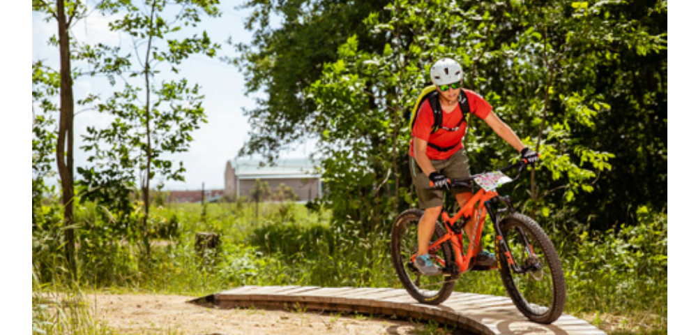
INTERMEDIATE SKILLS DEVELOPMENT