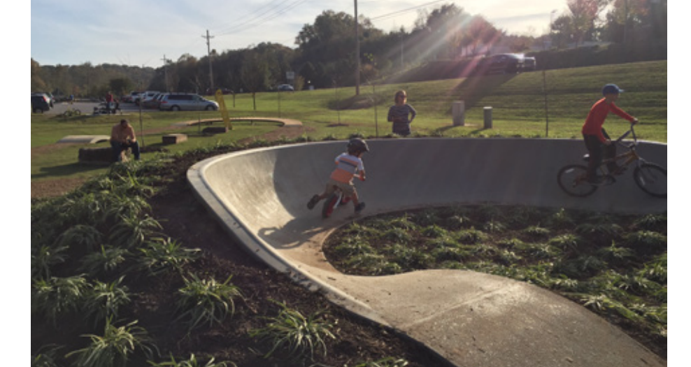
PUMPTRACK (PREFAB CONCRETE)